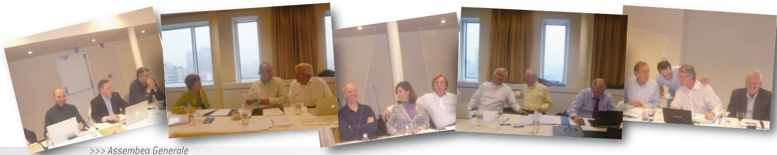
>>> Assemblea Generale

Le linee guida di questo Workshop saranno di grande aiuto sia per gli insegnanti che per gli studenti europei di parodontologia.